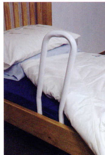
Shown on slatted bed for right hand assist

Do not use an abrasive detergent, cleaner or cloth to clean or dry this product.